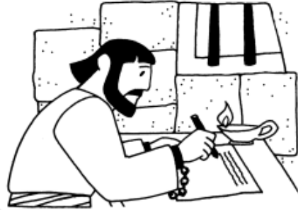
From The Complete Bible Story Clip Art Book.

The most likely year for the crucifixion of Jesus was 33AD. The widely accepted date for the conversion of St Paul is 34AD. Paul then spent three years in retreat, studying the life of Jesus, having fled from the Jews in